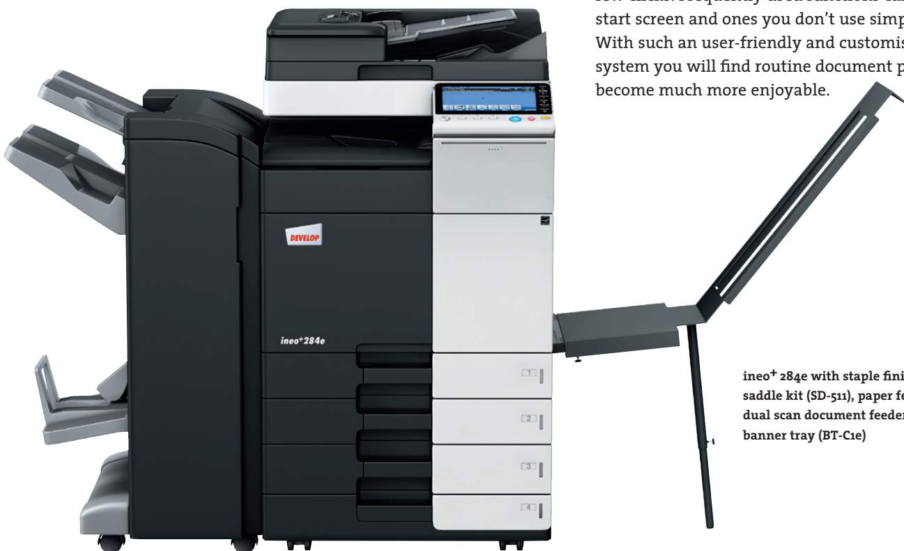
ineo+ 284e with staple finisher (FS-534), saddle kit (SD-511), paper feeder (PC-210), dual scan document feeder (DF-701), banner tray (BT-C1e)

Many multifunctional office systems are anything but user-friendly. The ineo+ 284e, in contrast, is simplicity itself. An intuitive, easily understandable operating concept ensures that it is as easy to use as your smartphone or tablet. The 9-inch capacitive touchscreen comes with familiar multi-touch operations such as flick, drag&drop and pinch in&out – so you will feel at home in this system in no time at all. Thanks to a new menu navigation structure you can see all functions in one go and select the settings you want with just a few clicks. Frequently used functions can be left on the start screen and ones you don't use simply removed. With such a user-friendly and customisable office system you will find routine document production jobs become much more enjoyable.