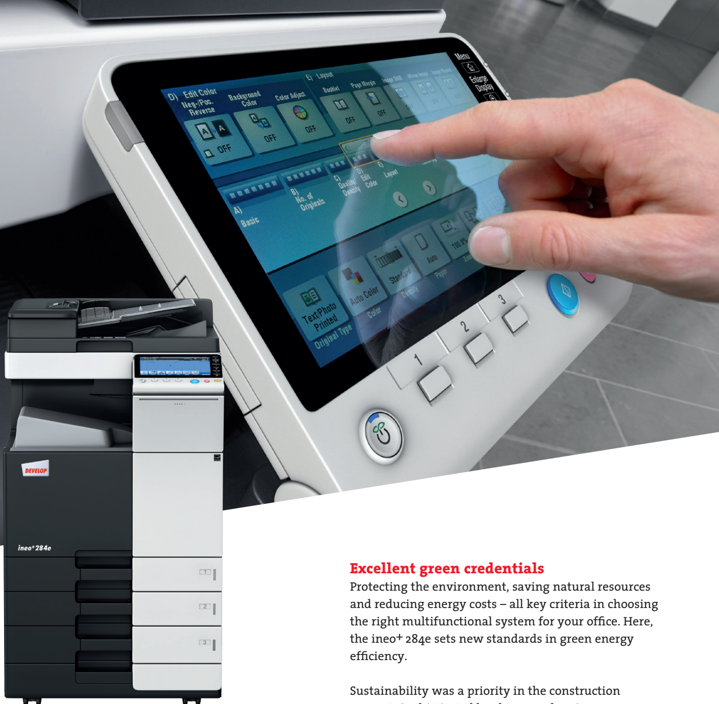
ineo+ 284e with paper feeder (PC-210) and dual scan document feeder (DF-701)