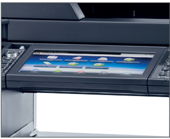
7" touch screen colour display, tilts through 0°, 10° and 20°