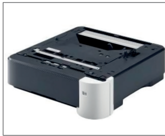
Optional large paper capacity up to 2,600 sheets